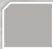
23 ASPEN GRAY