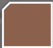
2 BASIN BROWN