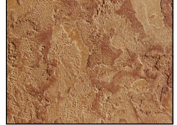
20-67 Sienna Standard Color