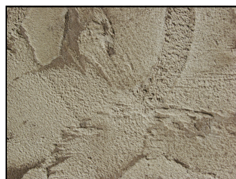
Gray Green Blend