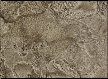
20-62 Gray Slate Standard Color