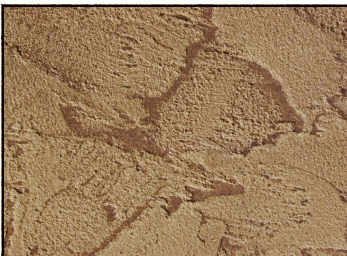
Amber Ale Blend