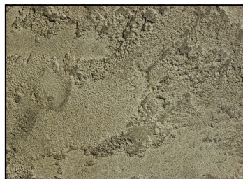
Sage Brush Blend