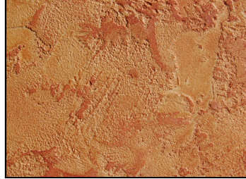
20-65 Sedona Red Standard Color