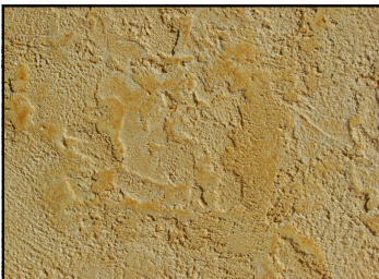
20-63 Sand Stone Standard Color