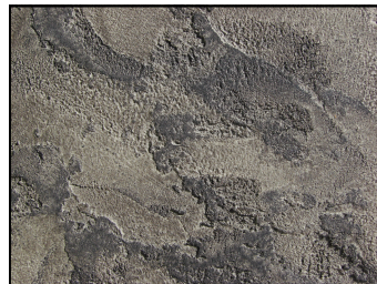
20-71 Black Standard Color